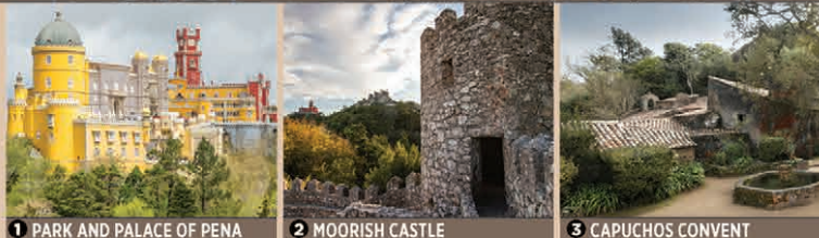
1 PARK AND PALACE OF PENA 2 MOORISH CASTLE 3 CAPUCHOS CONVENT

From Lisboa → Queluz: Train From Estoril/Cascais → Queluz: Train Sintra Line Cascais Line + Vimeca Bus No. 106