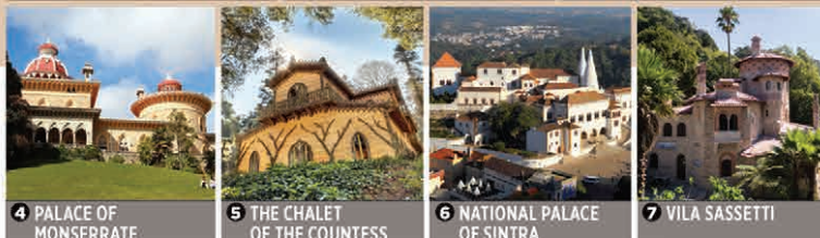
4 PALACE OF MONSERRATE 5 THE CHALET OF THE COUNTESS 6 NATIONAL PALACE OF SINTRA 7 VILA SASSETTI