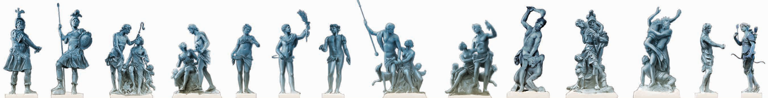
2 Mars 3 Minerva 4 Meleager and Atlanta 5 Vertumnus and Pomona 6 Spring 7 Summer 8 Autumn 9 Venus and Adonis 10 Bacchus and Ariadne 11 Cain and Abel 12 Aeneas and Anchises 13 The Rape of Proserpina 14 Apollo 15 Diana

An English sculptor working in London, he was particularly well-known for his lead statues, which were very popular in the 18th century. The group of sculptures at Queluz comprises the largest collection of the artist's work outside of England. They were chosen by King Pedro and commissioned in 1755 and 1756 by the Marquis of Pombal. Between 2003 and 2009 this exceptional collection was conserved and restored by the World Monuments Fund